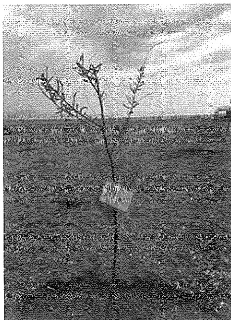
Figure 1: Tree adopted by young student

These actions are intended to raise awareness among local communities about tree planting and REDD+ activities within the “ 75UN-75 Trees UNAI SDG7 ” initiative, launched by the Energy Policy and Development Centre (KEPA) of the National and Kapodistrian University of Athens (NKUA) Greece.